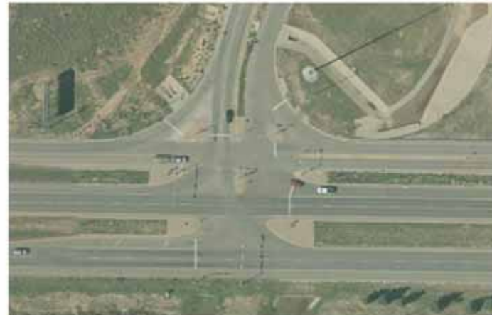
Loop 250 (W Ramp)